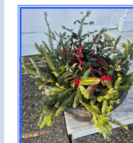
Twelfth Night Decor