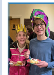
Twelfth Night King and Jester

Lanterns lined the walkways, candles lit the windows, and pine boughs donated by Kohl's Stony Hill Tree Farm decorated the mantles and the banister rail leading to the second floor. Music filled the house and docents costumed in late 17 th century garb welcomed visitors to a Priestley House celebration of Twelfth Night on January 5 th .