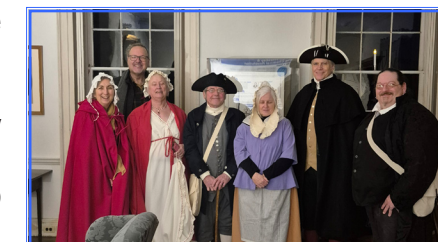
Twelfth Night Docents

Twelfth Night is one of several FREE events hosted by the Friends of the Joseph Priestley House Museum to offer visitors a taste of local history. The next FREE event will be Opening Day in March, when the museum returns to its regular weekend tours schedule.