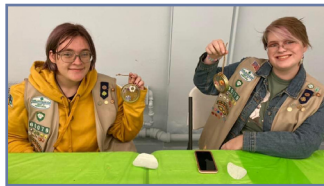
Take Home Project