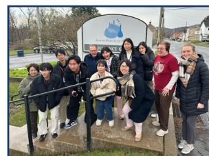
Senshu Tour Group

In the Fall of every school year students and chaperones from Selinsgrove Area High School travel to Tokyo for 10 days to experience the culture of a Japanese school and visit locations such as Kamakura, Tokyo Disney, and Mt. Fuji. In the Spring students from Senshu come to Selinsgrove Area High School to experience